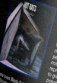
Hot Rats From left: Black Sabbath, Neil Young, Scott Weiland, Mark Lanegan, Chris Carraba, and so many other vocalists. "But when I heard 'Magnolia', besides the obvious influences, in some ways I feel strongly influenced by King Crimson, Rush and Deep Purple."